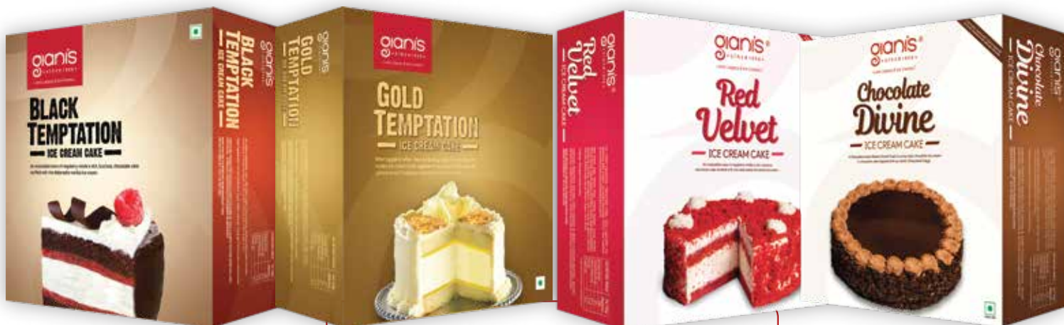
ICE CREAM CAKES

ICE CREAMS | STONE SUNDAES | THICK SHAKES | FALUDAS CONES | SODAS | FRUIT CREAM | KULFIS | ICE CREAM SUNDAES CASSATAS | ICE CREAM CAKES